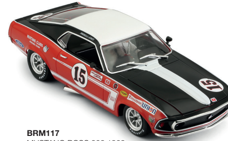
BRM117 MUSTANG BOSS 302 1969 Bud Moore Team #15 Parnelli Jones