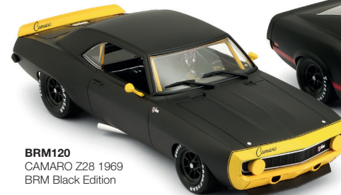
BRM120 CAMARO Z28 1969 BRM Black Edition