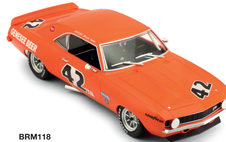
BRM118 CAMARO Z28 1969 Genesee Beer #42 - TransAm 1971 Brock Yates