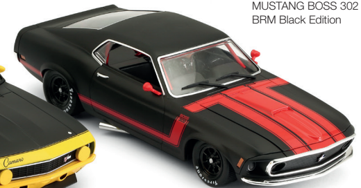
BRM-S01 MUSTANG BOSS 302 / CAMARO Z28 - Black edition Special twin pack limited edition